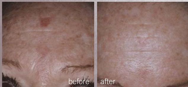
Excellent results after two treatments.

Talk with your doctor to discuss how elōs technology can help you achieve superior results for hair removal and/or the appearance of rejuvenated skin.