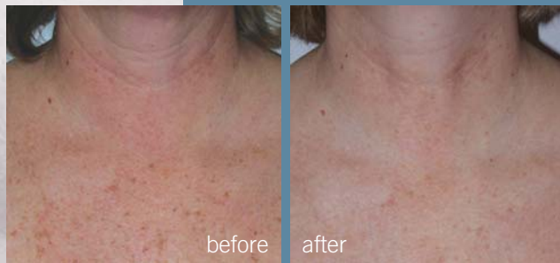
Clinical photo showing results after two treatments of lentigines with elōs technology.