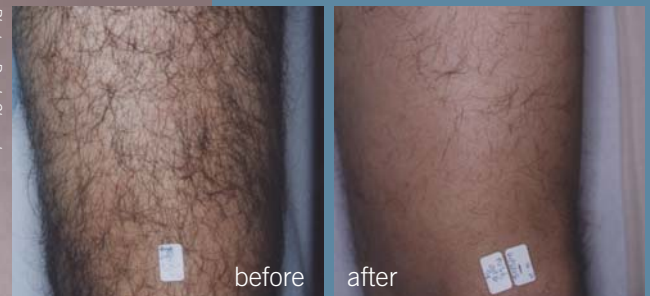
Excellent hair removal results after two treatments.